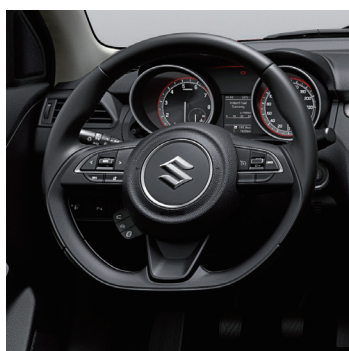
Sporty, multi-functional, D-shaped steering wheel

Inside, the Swift adds a layer of sophistication to the sportiness with a driver-centric cockpit, delivering driving confidence and improved convenience on the road.