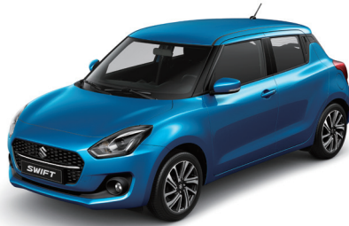
Speedy Blue Metallic