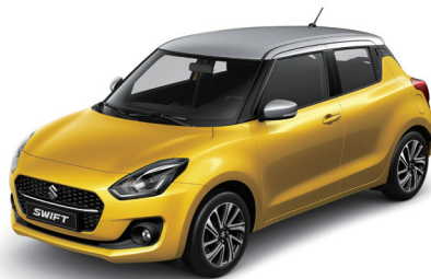
Rush Yellow Metallic (with Premium Silver Metallic roof)