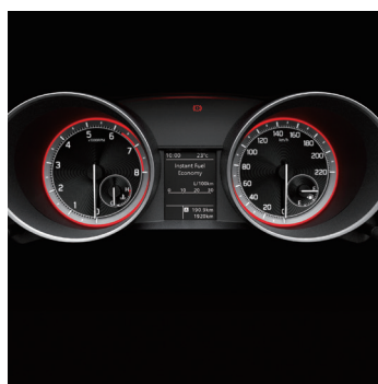
Cylindrical gauges with a centralised, multi-information display