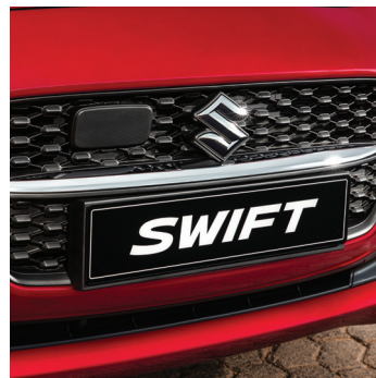
Three-dimensional diamond grille with a horizontal silver line for a more refined look