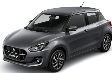
Mineral Metallic Gray