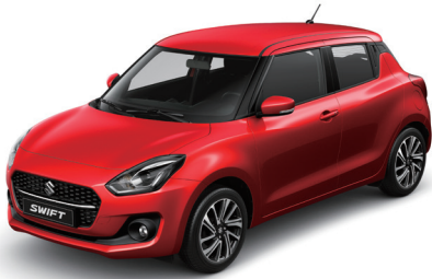
Burning Red Pearl Metallic