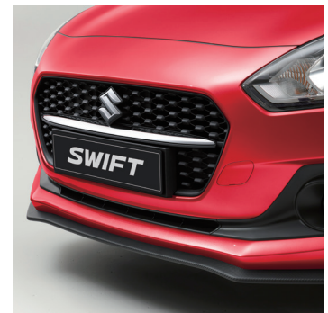
Sporty and bold front face

The new Swift brings the heat to a whole new level with a sportier, more dynamic exterior and styling that brings excitement and joy before you even step into the car.