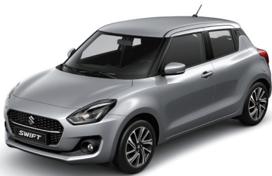
Premium Metallic Silver