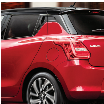
Strong shoulders and wrap-around windows, featuring hidden door handles for a sportier, coupé look