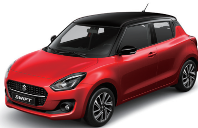
Burning Red Pearl Metallic (with Super Black Pearl roof)