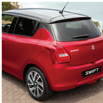
'Floating' roof and high-mount brake lights for sophisticated safety