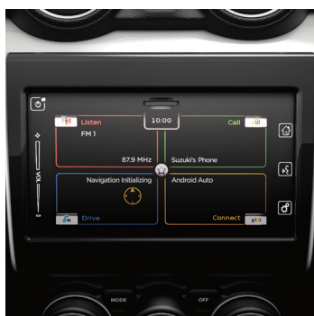
Stay connected in style with Apple CarPlay® and Android Auto™ capabilities