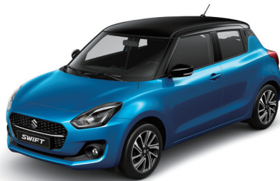
Speedy Blue Metallic (with Super Black Pearl Roof)