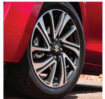
Finely crafted 16" factory-fitted alloy wheels