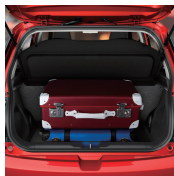
Plenty of boot space for all your spicy urban adventures