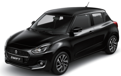
Super Black Pearl