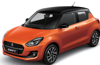
Frame Orange Metallic (with Super Black Pearl roof)