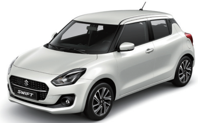
Pure White Pearl